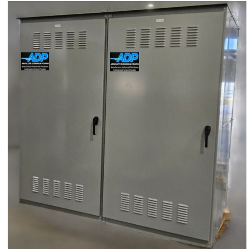
Low Voltage Switchboard (UL891)

Whether it's a new installation or an upgrade to existing infrastructure, ADP's Low Voltage Switchboards provide a flexible, high-performance solution that supports complex load profiles and future expansion—without compromising safety, uptime, or budget.